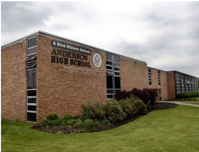
Work renovating Anderson High School has led to a lawsuit.